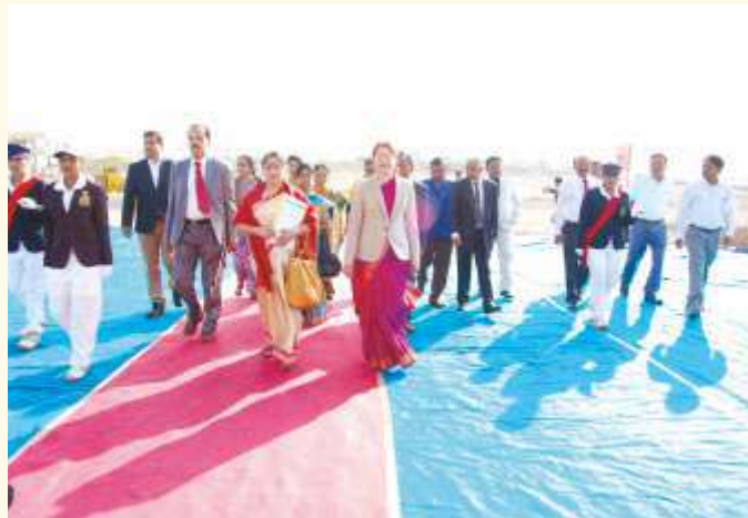
Warm Wel Come to NAAC PEER TEAM CHAIRMAN AND MEMBERS