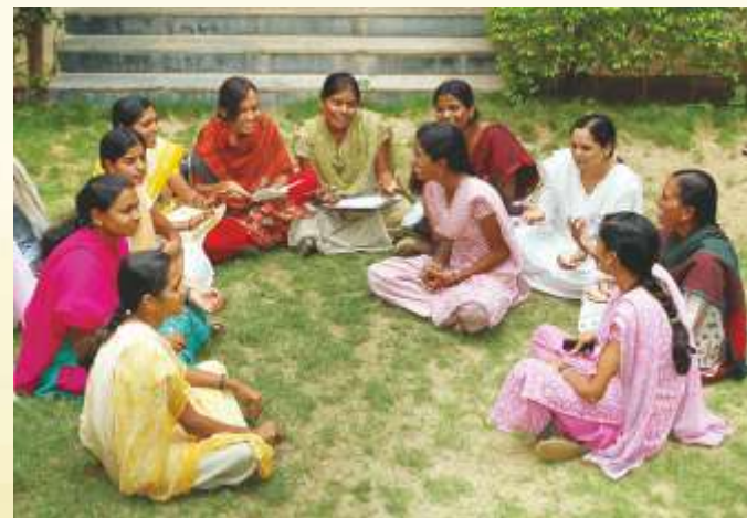
Learning through Group Discussion