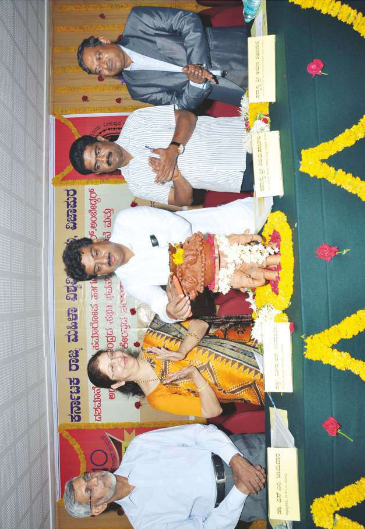
Decennial Year valedictory June 2013