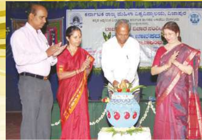
Inauguration of State Level Seminar on Folk conducted by Kannada Dept.