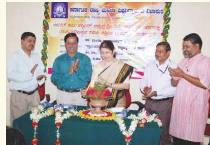
Inauguration of Shri.Gurupadappa Nagamarapalli Endowment Lecture conducted by Dept. Journalism and Mass Communication