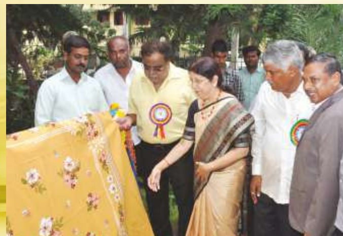
Mandya District in charge Minister Shri.Ambareesh inaugurating Mandya PG Extension Center