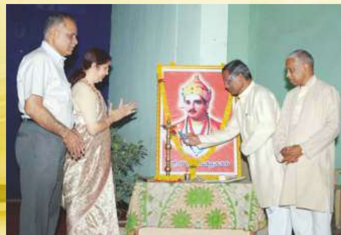
Celebrated Basava Jayanthi Programme