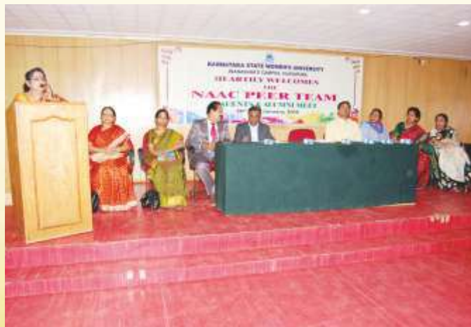
NAAC PEER TEAM interaction with Parents