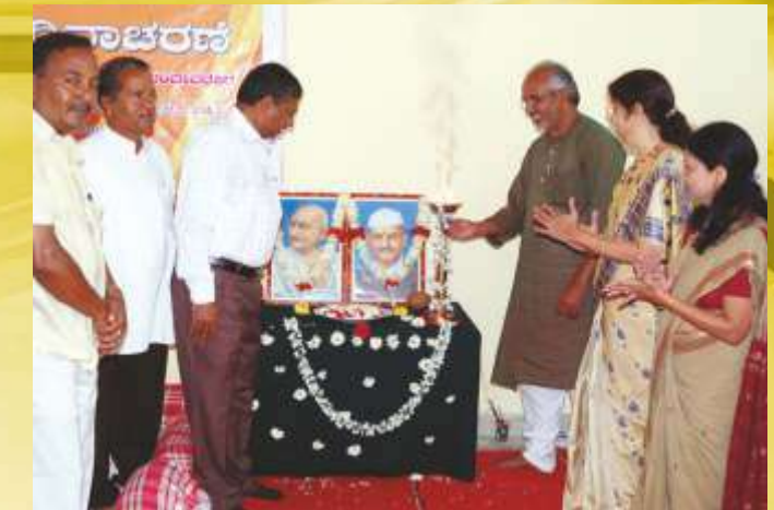
Celebrated Mahatma Gandhiji and Lal Bahadur Shastri Jayanthi