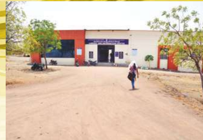
Constructed first stage of Library Building