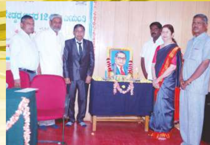
Celebrated 124th Dr. B R Ambedkar Jayanti