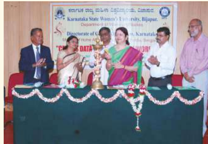
Inauguration of census Programme