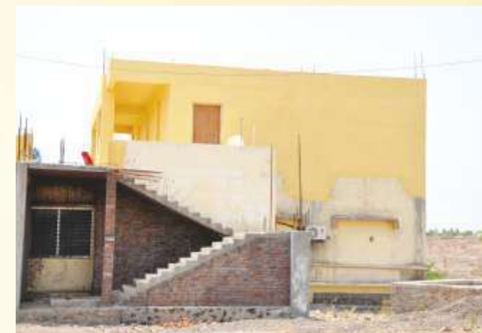
Constructed Building of Academy of Competitive Examinations