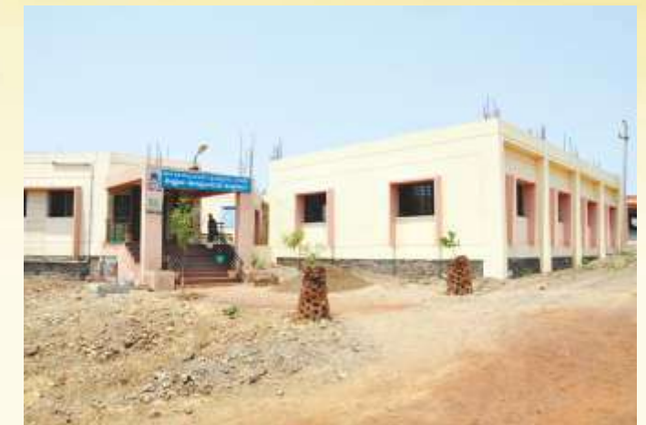
Constructed Education Dept. Building extension