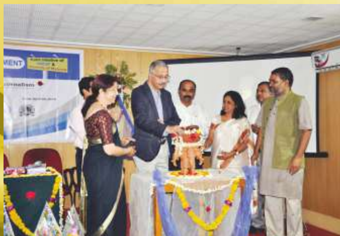
Inauguration of Media Orientation Programme conducted jointly by the Department of Journalism and Mass Communication and Mysore University.