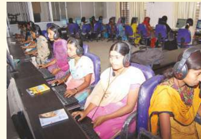
Upgraded Language Lab