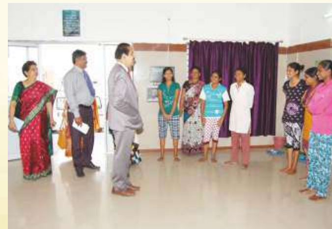
NAAC PEER TEAM interaction with Hostel Students