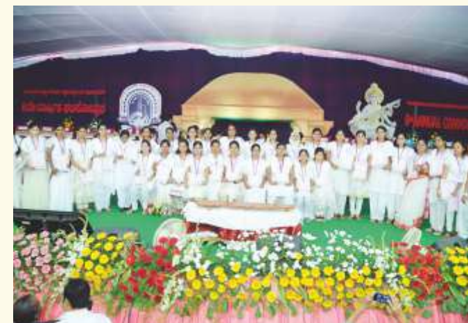
Gold medalists of the 6th annual Convocation, KSWU 2015