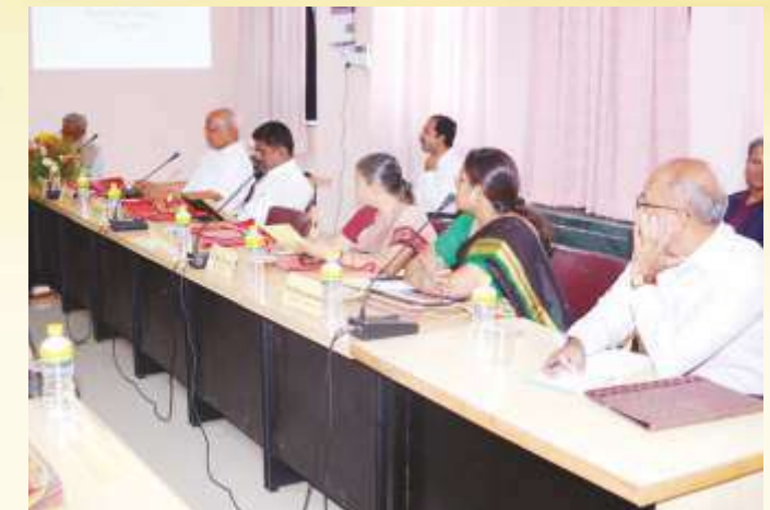
A cross section of the dignitaries