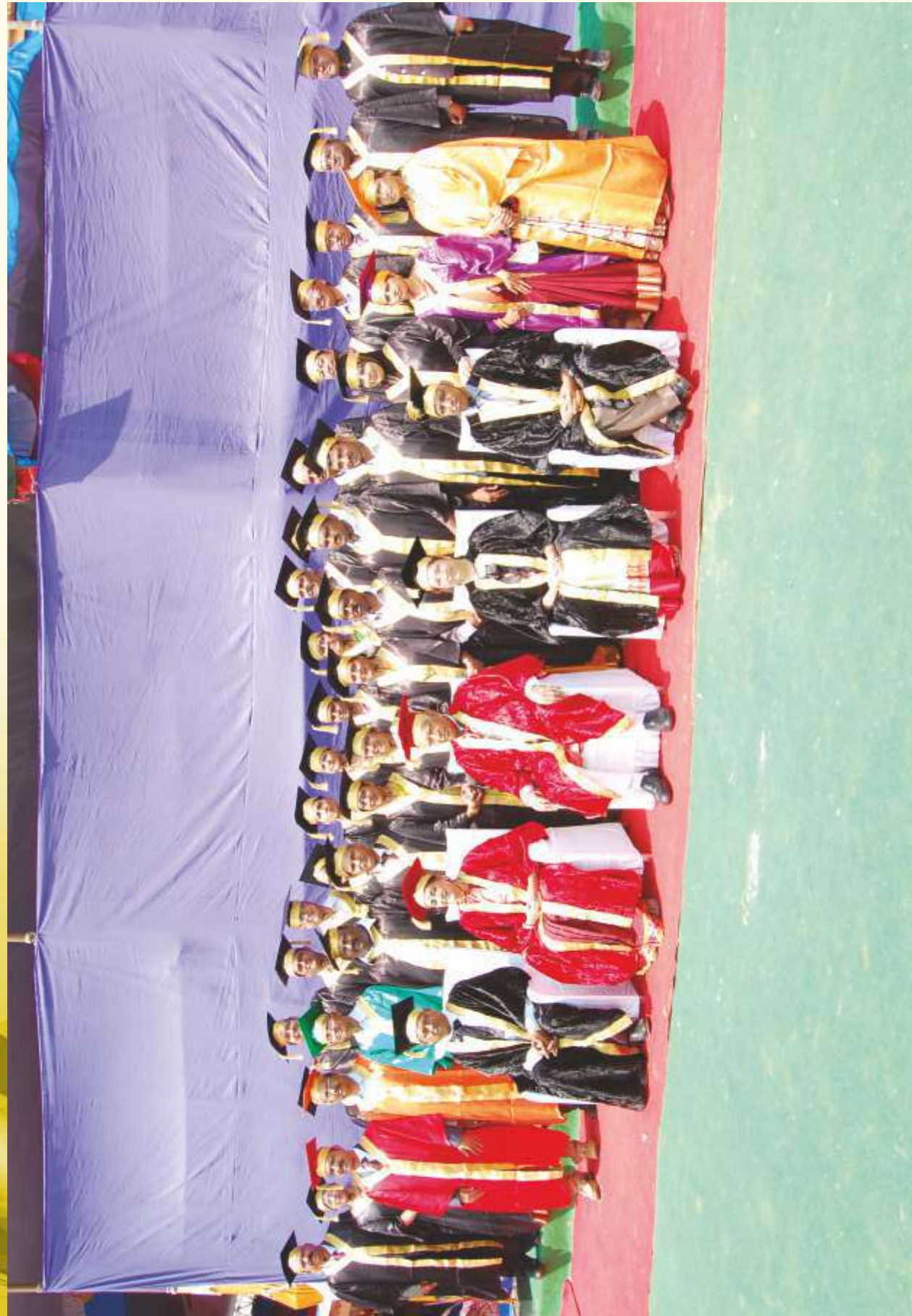
Syndicate and Academic Council members with Chancellor and Governor of Karnataka Shri. Vajubai Vala during 7th Convocation