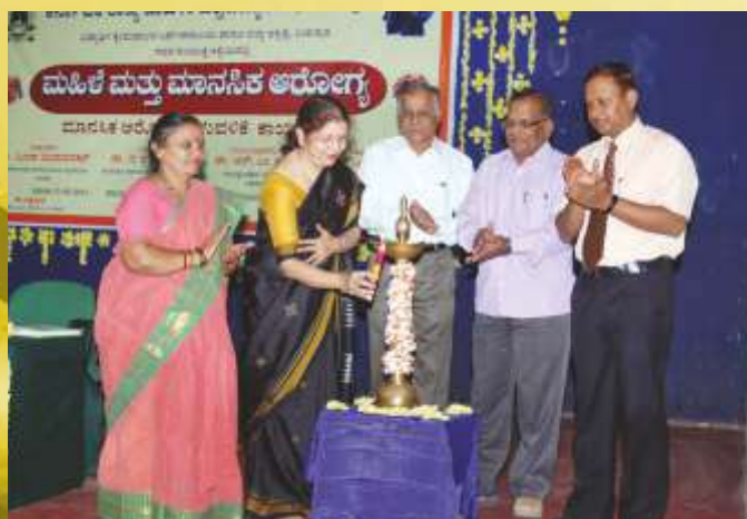
Inauguration of Awareness programme on Women and Mental Health