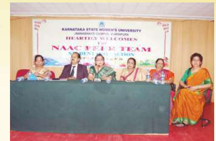
NAAC PEER TEAM interaction with students