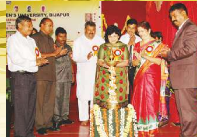
Inauguration of International seminar conducted by English Department