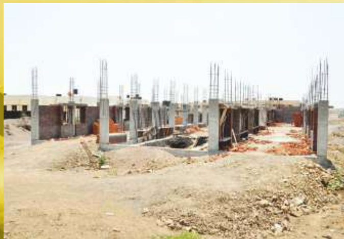
Girls Hostel Building under construction