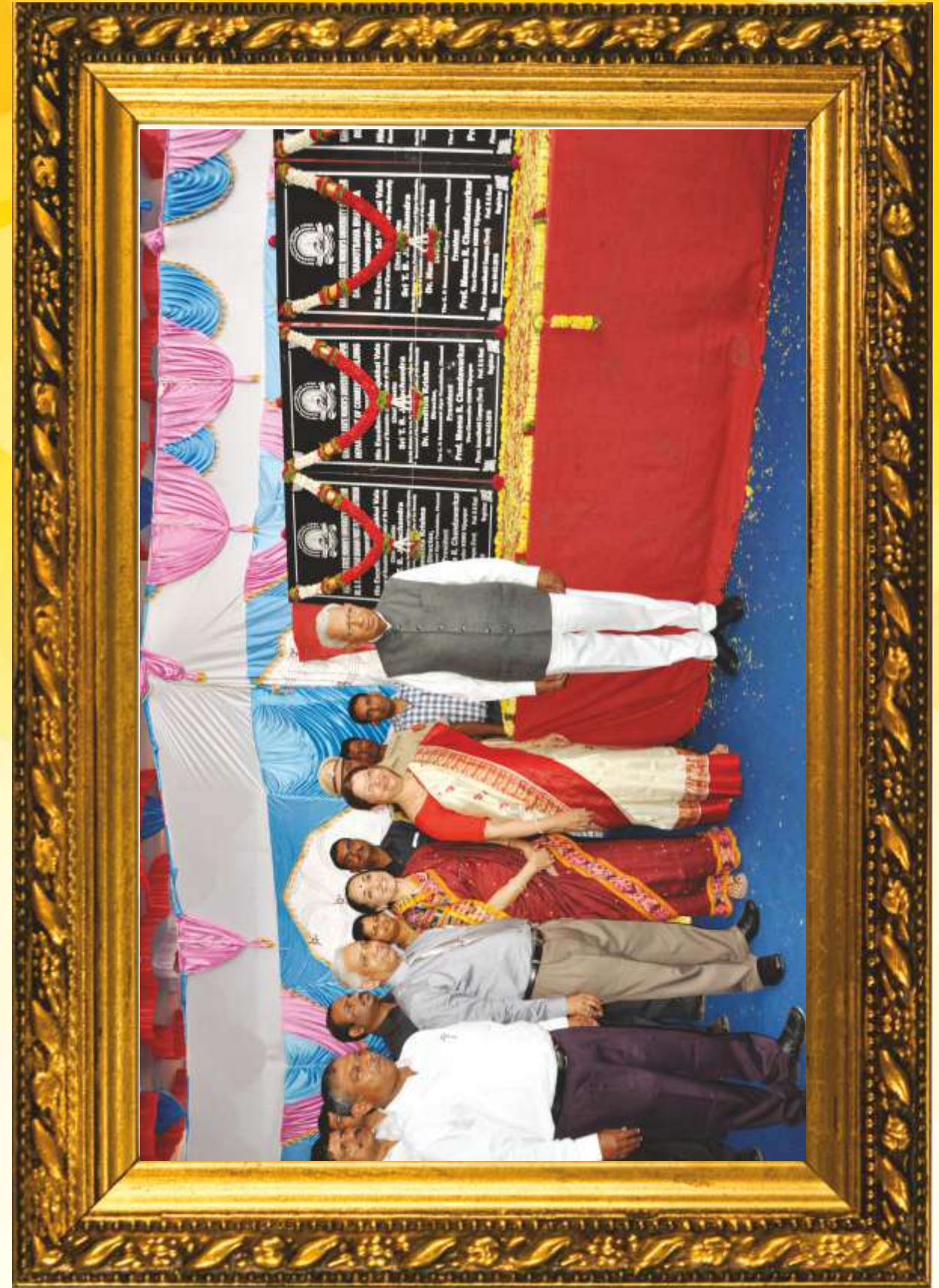
HIS EXCELLENCY GOVERNOR OF KARNATAKA SHRI. VAJUBAI VALA INAUGURATED NEW BUILDINGS OF KARNATAKA STATE WOMEN'S UNIVERSITY ON 4TH MARCH 2016.