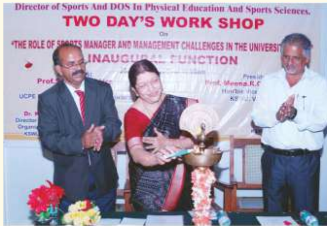
Inauguration of Two Days Workshop conducted by Sports Dept.