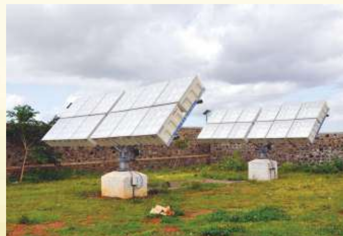
Electricity generation through Solar System