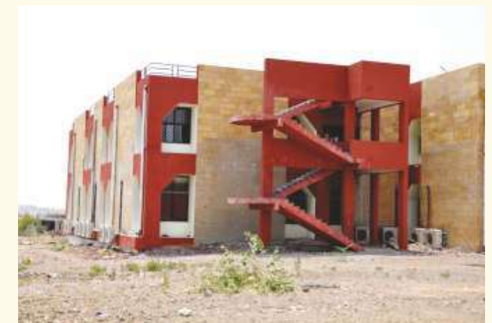
Science Block Extension