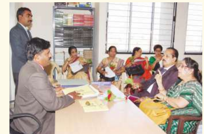
NAAC PEER TEAM Distance Education Dept.