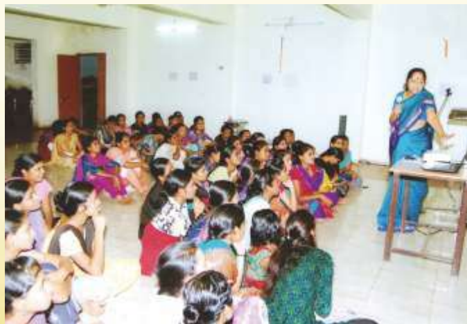
Counseling session by a Gynaecologist for hostel students