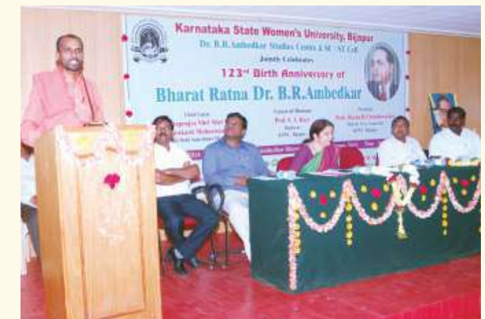
Celebrated 123rd Dr. B R Ambedkar Jayanti