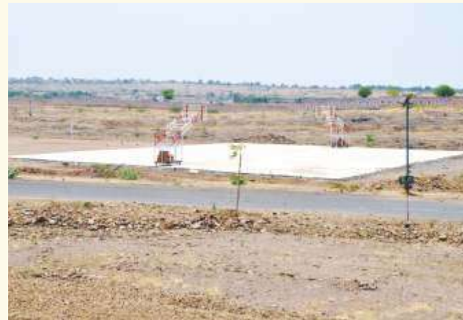
Constructed Basket Ball court