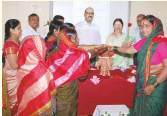
Inauguration of Workshop for Women Grama Panchayat Members conducted by Dept. of Library and Information.