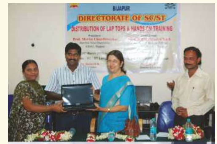
Distribution of Laptops to SC/ST students