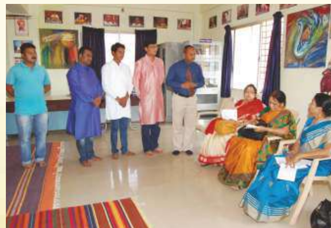
NAAC PEER TEAM visit to Department of Performing Arts