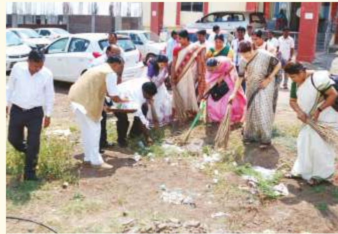
Swchha Bharta Abhiyana