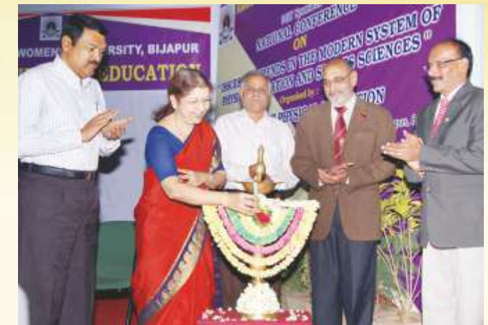
Inauguration of National Conference conducted by Sports Department