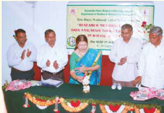
Inauguration of ICSSR sponsored Research Methodology Workshop