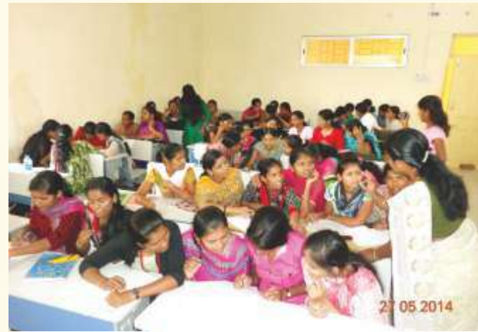
Teaching through industrial attention