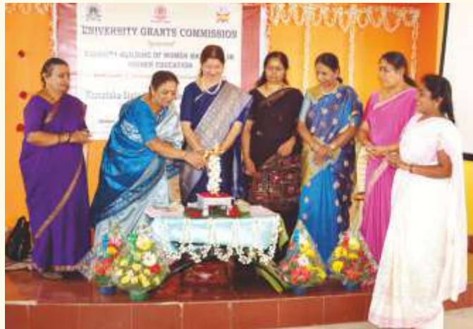
Inauguration of Capacity Building of Women Managers conducted by Women's Study Center.