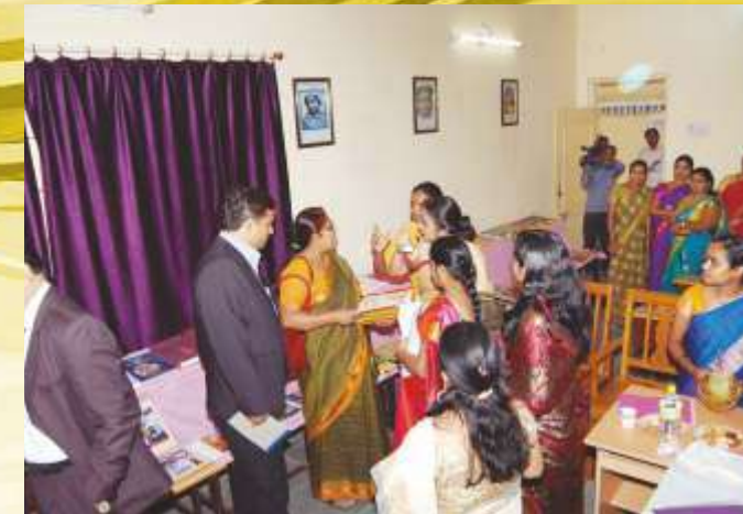
NAAC PEER TEAM visit to Women's Study Department