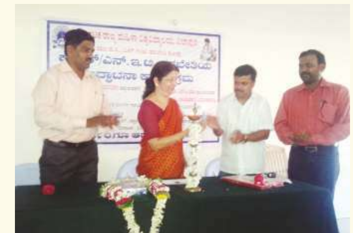
Inauguration of NET coaching classes