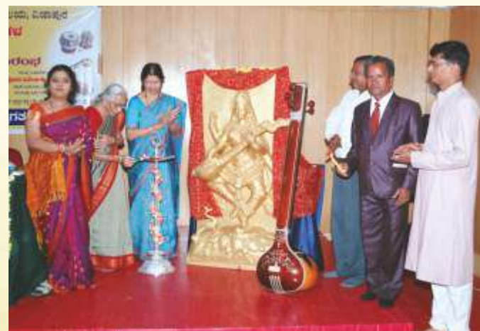
Inauguration of Performing Arts Dept.