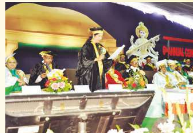
VC Prof.Meena R Chandawarkar delivering the presidential address at 6th Convocation - 2015