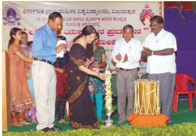
Inauguration of Yakshagana Programme