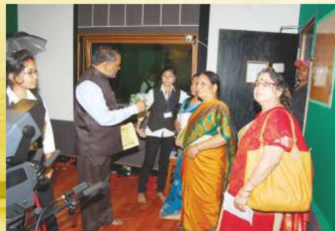
NAAC PEER TEAM visit to Jnanavahini Media Studio