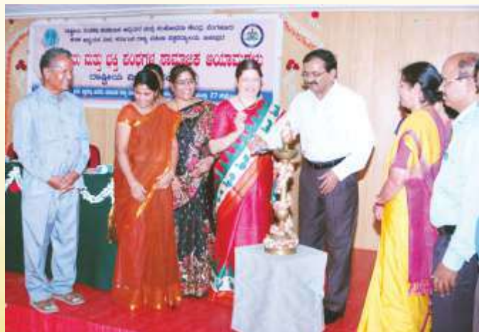
Inauguration of National Seminar conducted by Kanaka Study Center