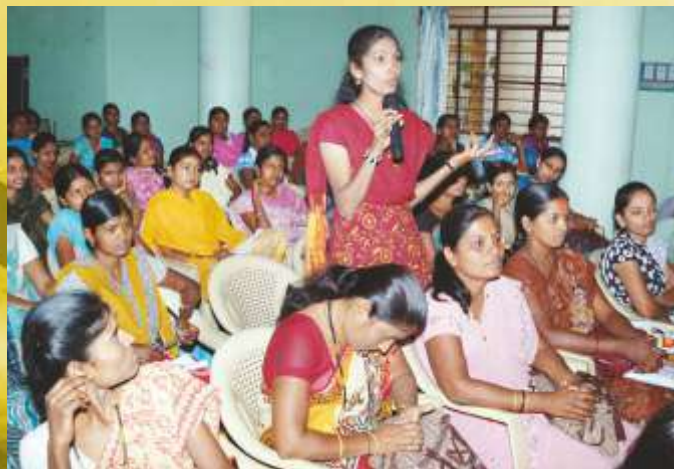
A Student interacting with Experts