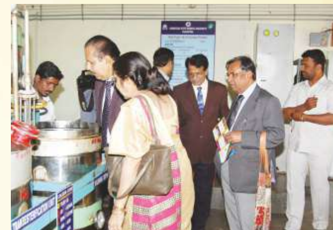
NAAC PEER TEAM visit to Bio Diesel Park