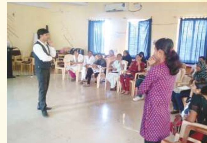
Personality Development Class