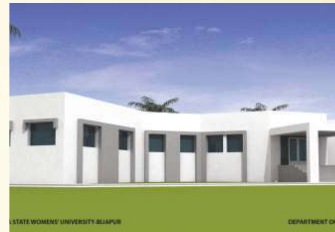
Blue Print of Education Dept. Building