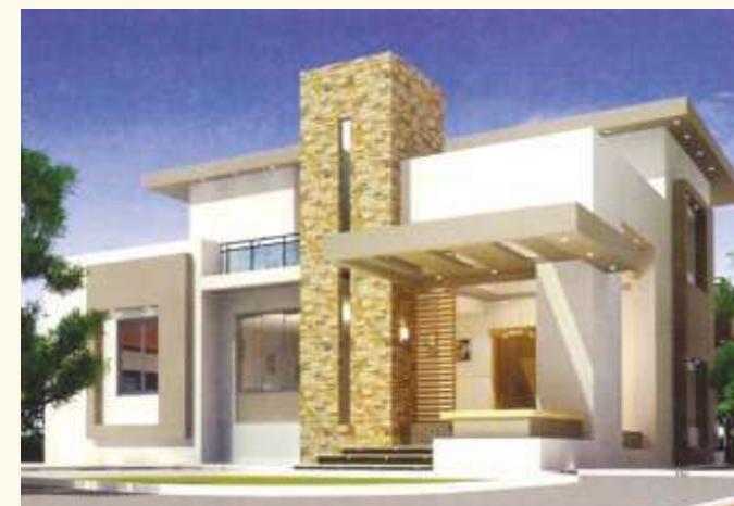
Blue Print of Vice Chancellor Bungalow