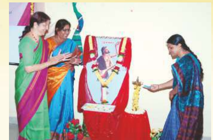
Celebrated Kanakadasa Jayanthi