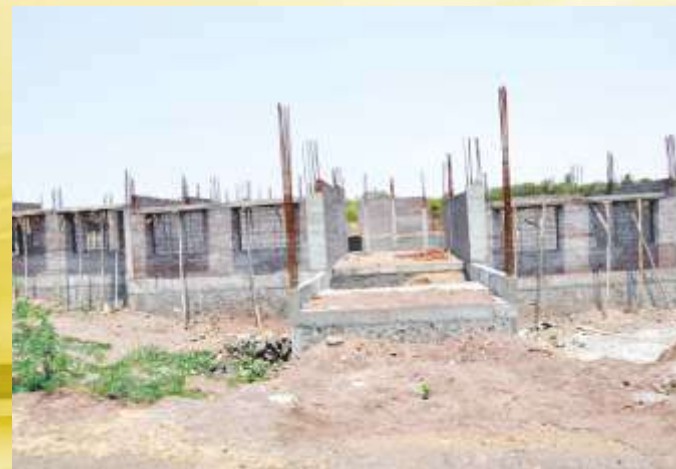
Chemistry Dept. Building under construction