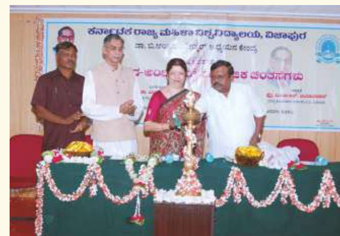
Inauguration of Special Lecture on Thoughts of Dr.B.R.Ambedkar