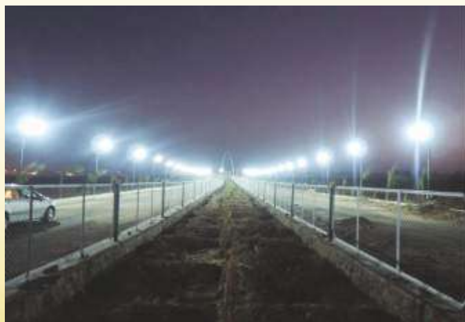
Installed Solar Lights