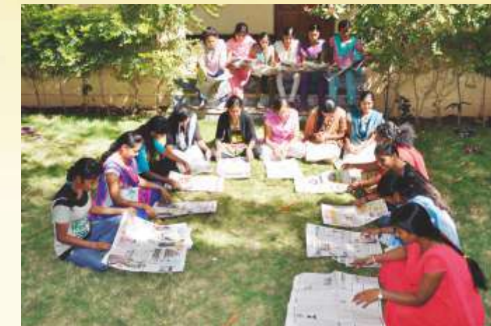
Aralikatte- Suddi Harate- Newspapers Reading Forum