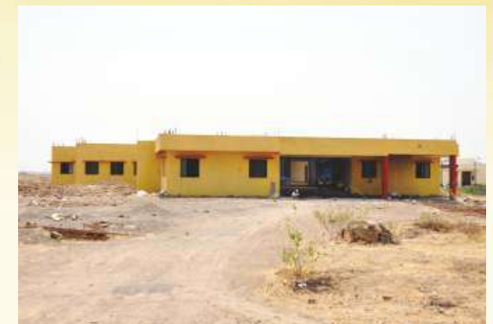
Commerce and Management Dept. Building