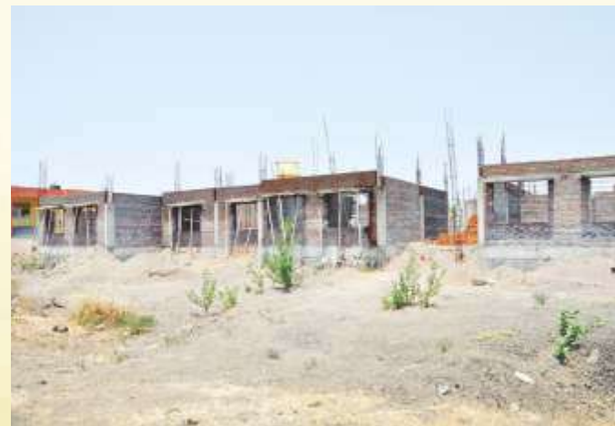
Botany Dept. Building under construction