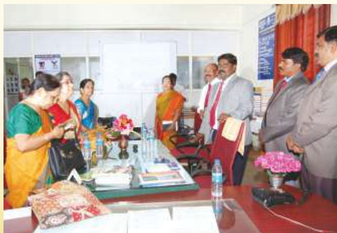
NAAC PEER TEAM visit to Physical Education Dept.