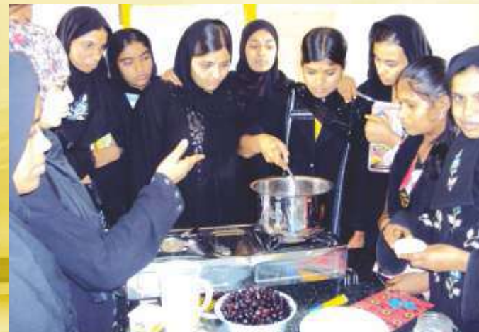
Food Technology Training programme