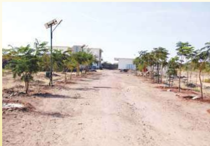
Planted road side trees