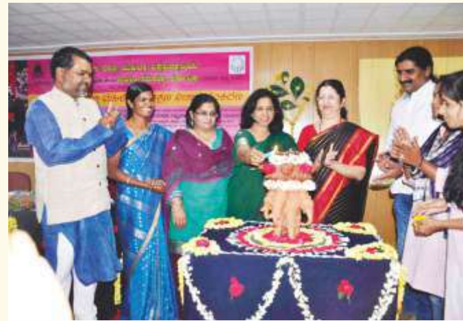
Inauguration of State Level Seminar on Portrayal of Women in TV Serials conducted by Journalism and Mass Communication Department