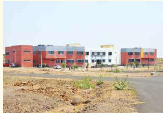
Constructed Social Science Block