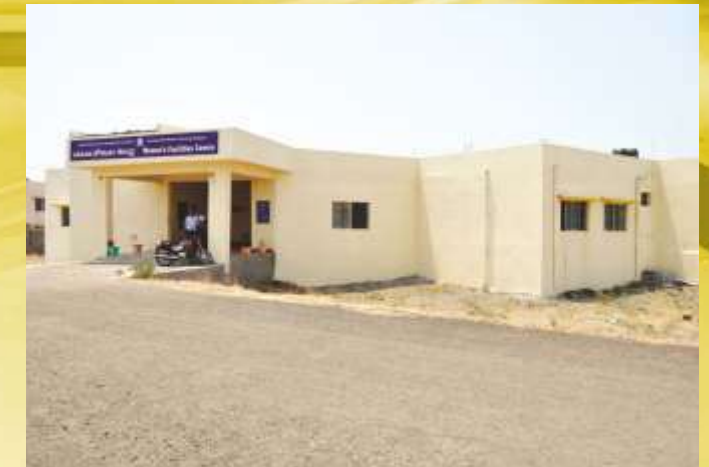
Women's Facilities Center