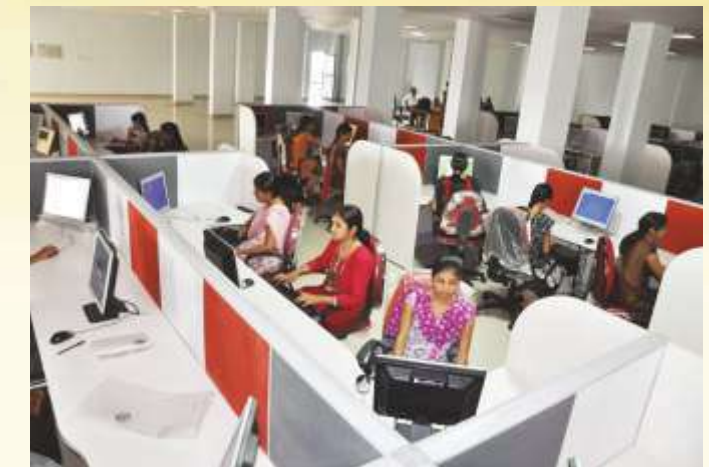
Upgraded Computer Center