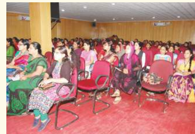
Students interaction with NAAC PEER TEAM