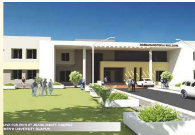
Blue Print of Dashamanotsava Bhavan