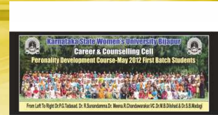
Personality Development Course First Batch Students