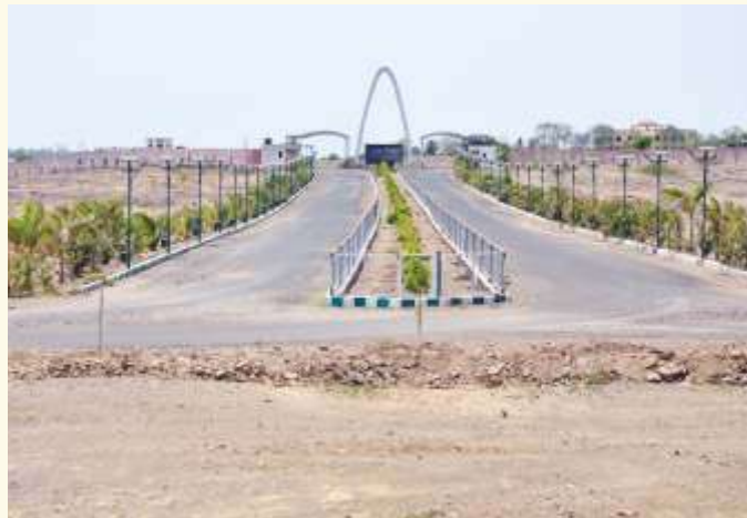
Front gates roads developed