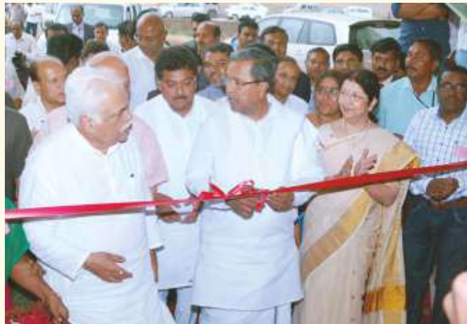
Shri. Siddaramiah Chief Minister inaugurating Administration Block in KSWU- 2015