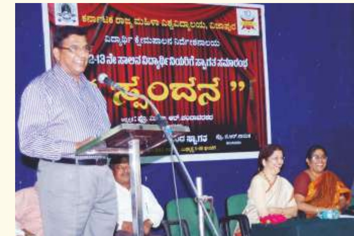
Spandana- Orientation programme for Fresher's