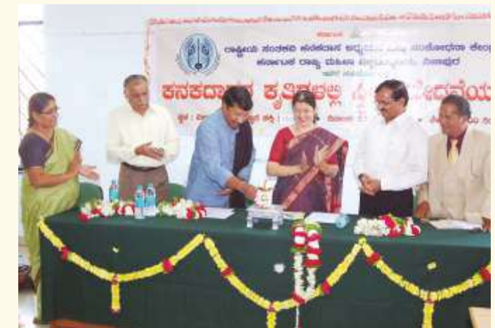
Inauguration of National Seminar on Women issues in Kanakadasa Poem