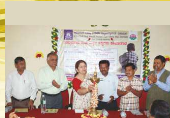
Inauguration of Workshop on Child Rights and Media conducted by Journalism and Mass Communication Department