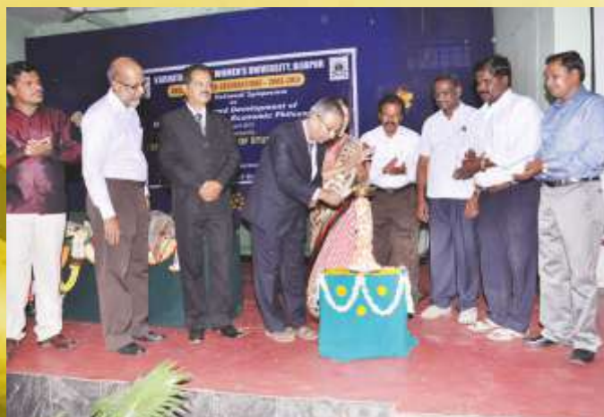
Inauguration of National Symposium on Economics conducted by Economics Dept.