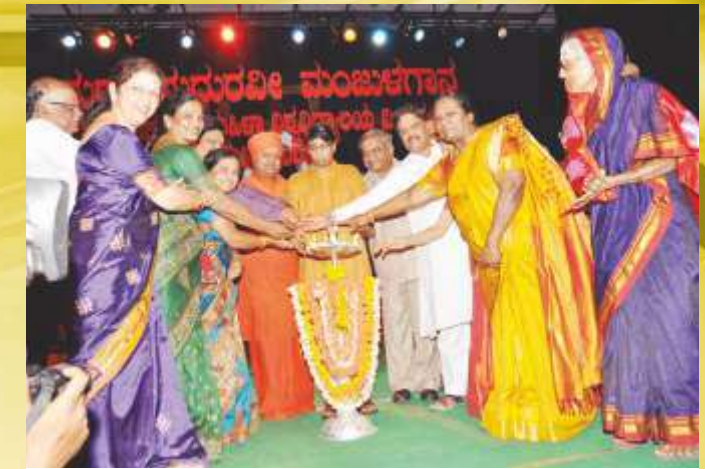
Inauguration programme of Madura Madurvi Manjula Gaana, in collaboration with DD Chandana