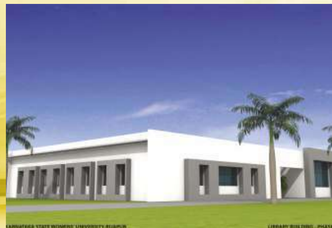
Blue Print of Library