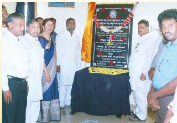
SC/ST STUDENTS' HOSTEL FOUNDATION STONE LAID BY SOCIAL WELFARE MINISTER SHRI. H. ANJANEYA