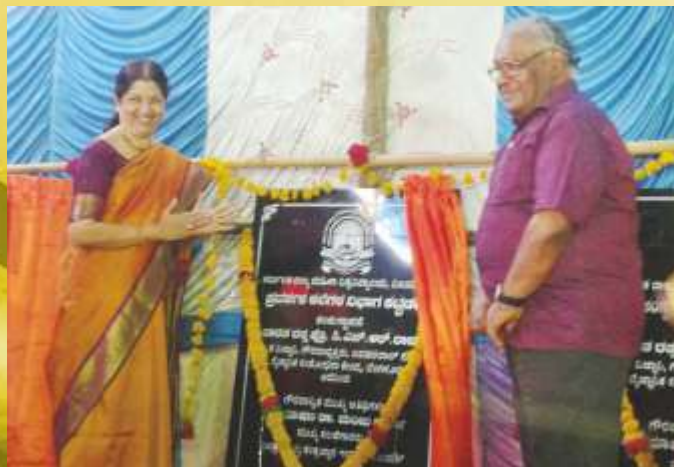
Prof. C.N.R. Rao laying foundation stone for Dept. of Performing Arts