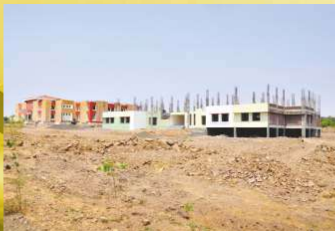
Dashamanotsava Bhavan under construction