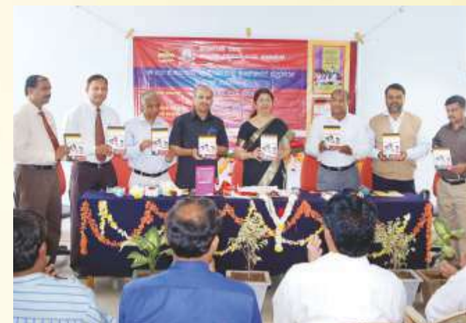
Books Releases function by Prasaranga