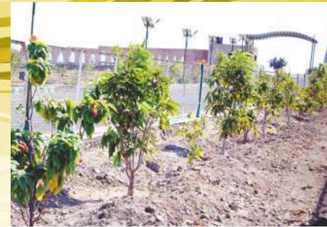
Trees planted Front gates