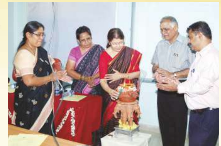
Inauguration of Research Methodology Workshop