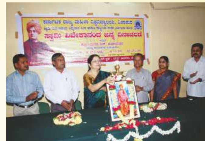
Celebrated Swami Vivekananda Jayanthi