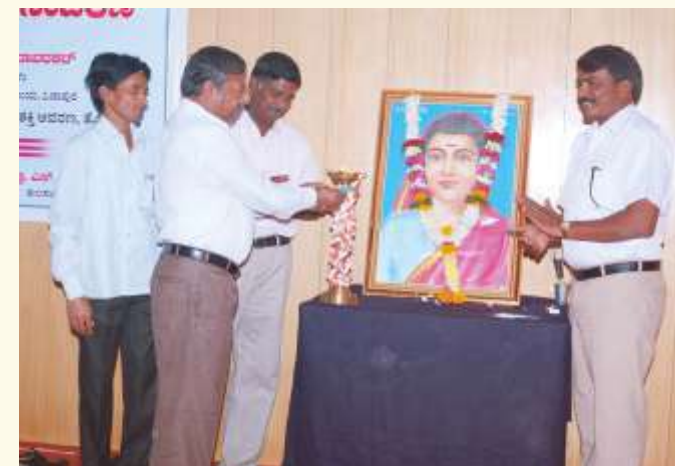
Celebrated SAVITRIBAI PHULE Jayanthi