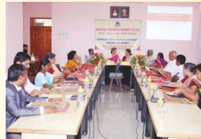
Round Table Meeting: A Bird's eye view