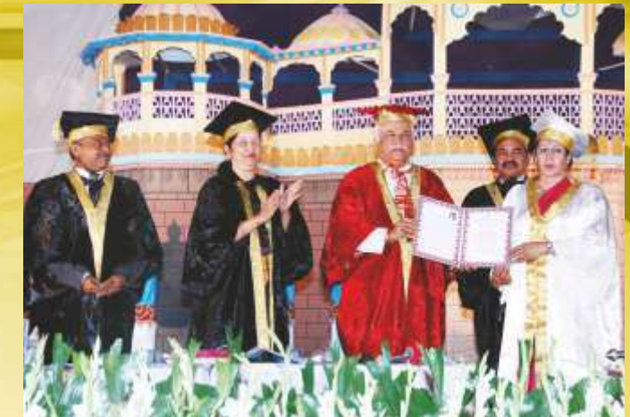
Pro-Chancellor and Minister for Higher Education Shri. R.V.Deshpande, conferring Hon. Doctorate at 5th Convocation 2014