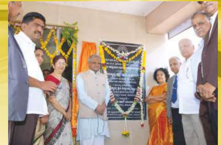
Shri.P.V.Krishna Bhat inaugurating Education Dept. Building