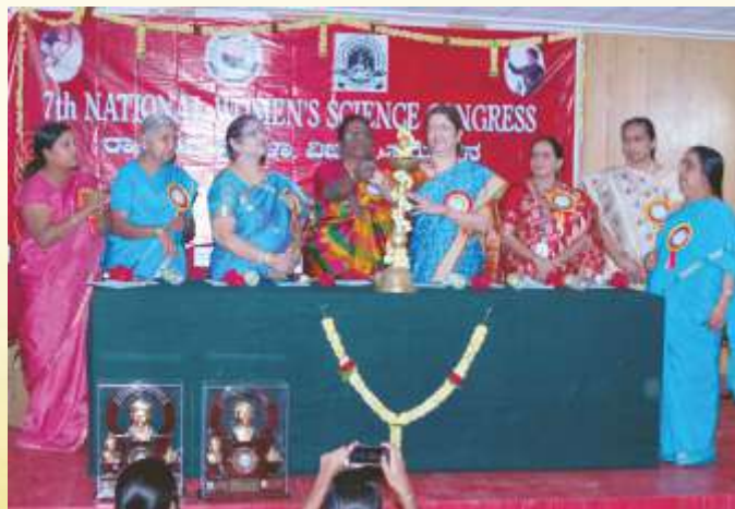
Inauguration of 7th National Women Science Congress