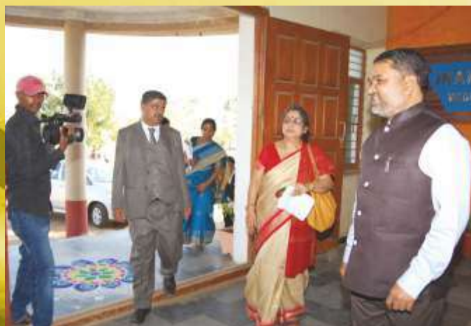
NAAC PEER TEAM visit to Departments of MLC and JMC