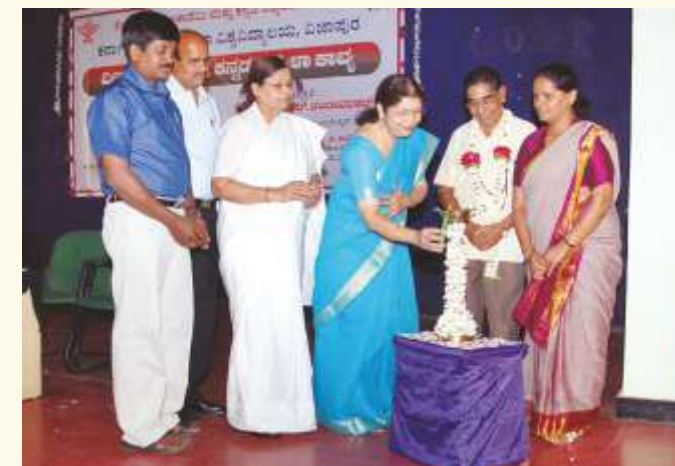
Inauguration of Special Lecture on Women's Kannada Poetry conducted by Kannada Dept.