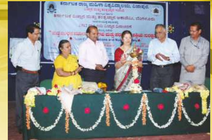
Inauguration of National Science Day