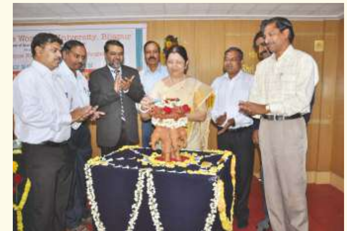
Inauguration of National Seminar conducted by Journalism and Mass Communication Department