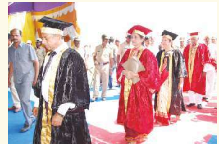
7th Convocation procession