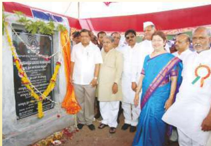
Shri. Jagadeesh Shettar Ex-Chief Minister inaugurating Dashamanotsava Bhavan