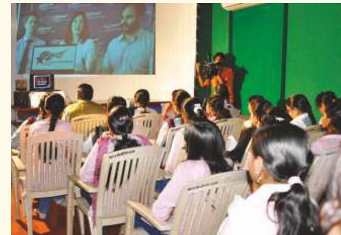
Interaction with American Embassy