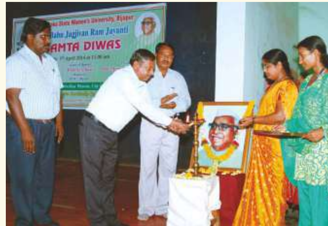
Celebrated Dr.Babu Jagjeevan Ram Jayanthi