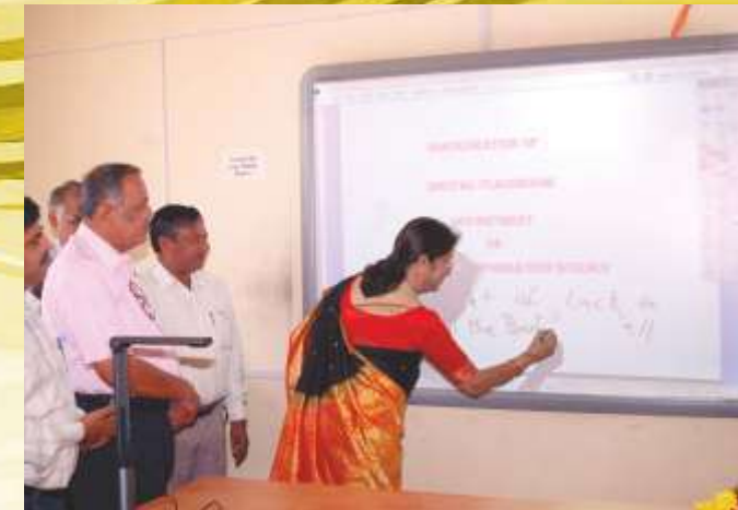
Inauguration of First Digital Class Room at Department of Library and Information Science.