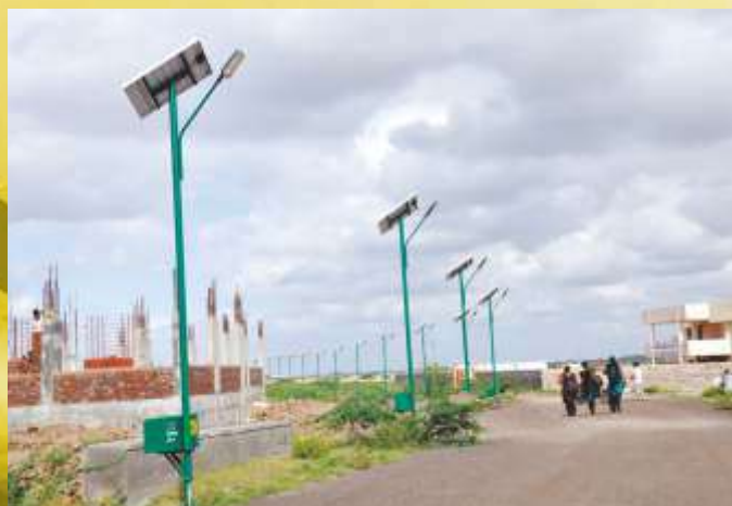
Solar street Lights