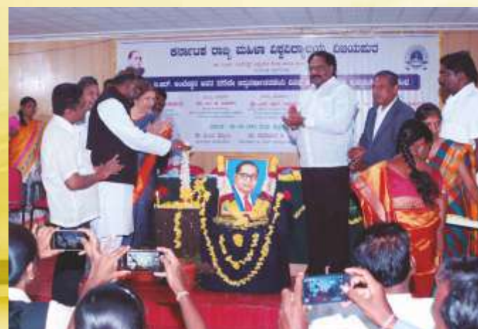
AMBEDKAR SPECIAL LECTURE PROGRAMME INAUGURATION BY SOCIAL WELFARE MINISTER SHRI. H. ANJANEYA