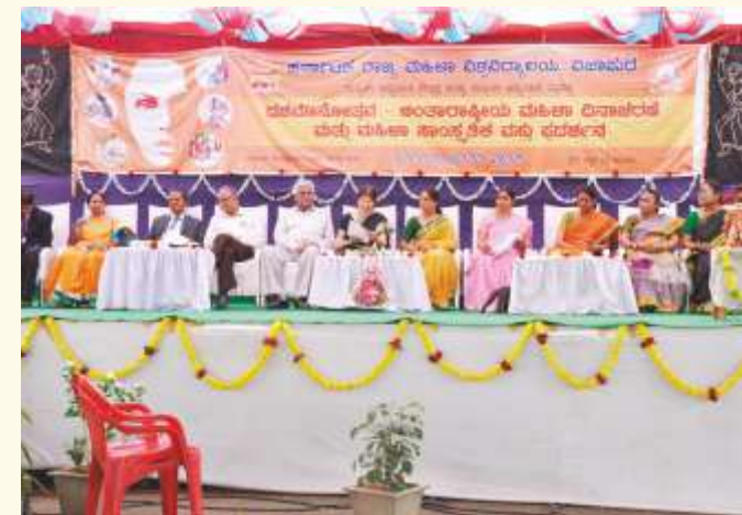
Women's Day Programme and Exhibition