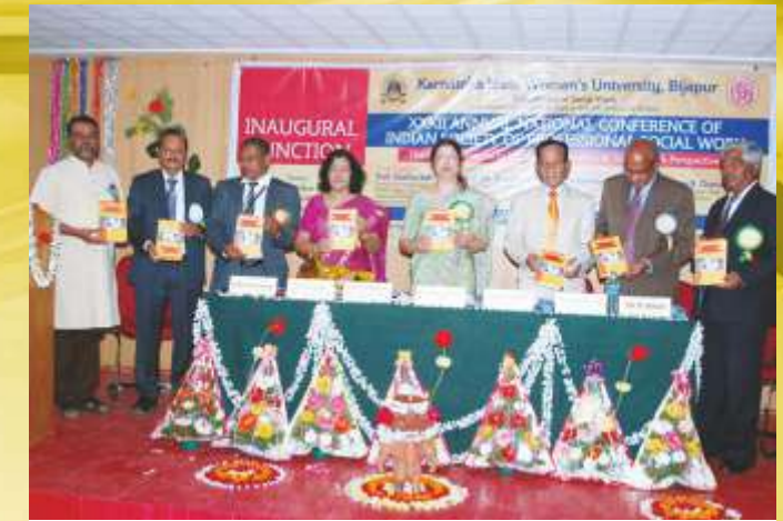
Book release programme in MSW National Conference