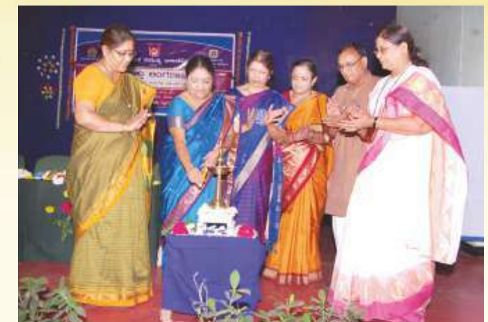
Inauguration of National Seminar on Women and Gender Politics