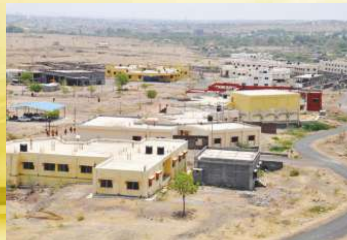
An over view of the Jnanashakti Campus