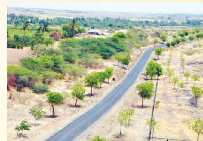
Outer roads developed