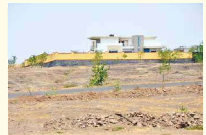
Constructed Vice Chancellor Bungalow