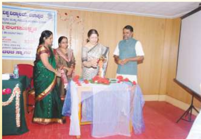
Inauguration of State Level Seminar on Gender Sensitivity and Media conducted by Women's study Center and Dept. Journalism and Mass Communication