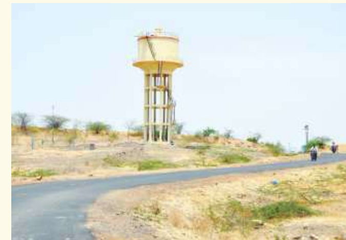
Constructed Water Tank