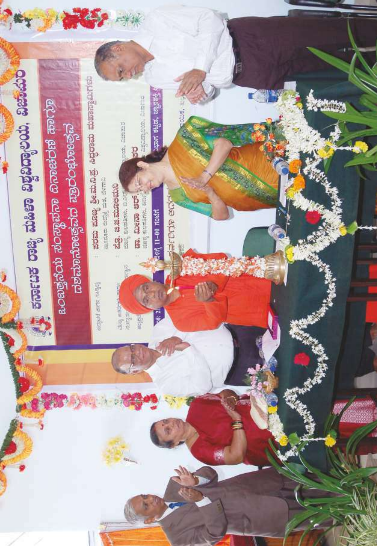
Decennial Year inauguration June 2012