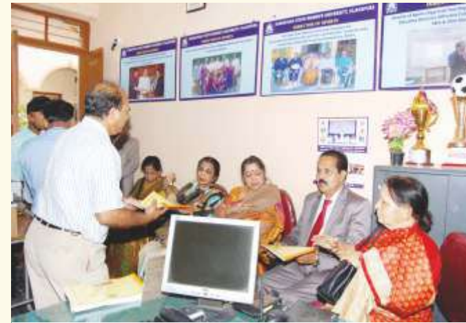
NAAC PEER TEAM Visit to Sports Directorates