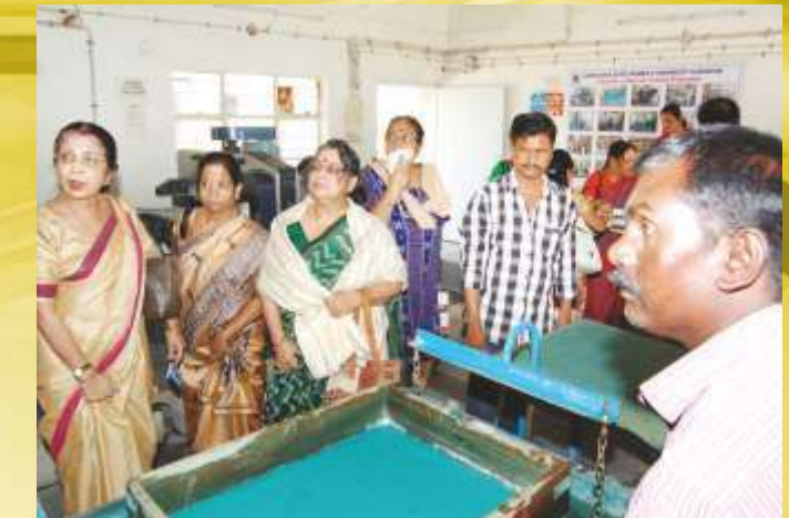
NAAC PEER TEAM visit to Paper Recycling Unit