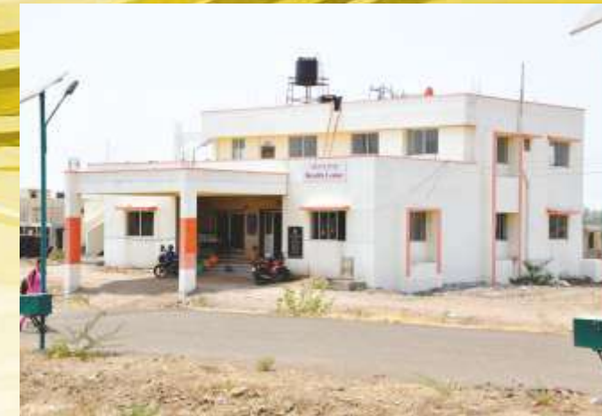
Constructed Health Center