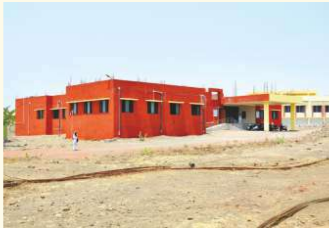
Constructed Kannada Dept. Building