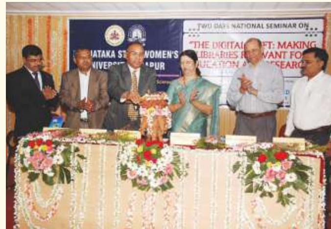
Inauguration of National Seminar conducted by Department of Library and Information Science.