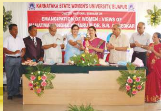
Inauguration of National Seminar on Emancipation of Women-Views of Mahatma Gandhiji, Neharu and Dr.B.R.Ambedkar