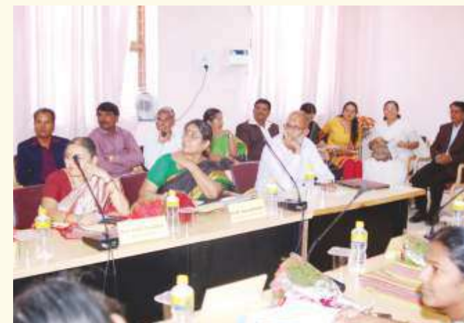
Another cross section of the dignitaries