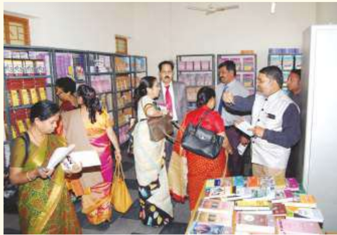
NAAC PEER TEAM Visit to PRASARANGA