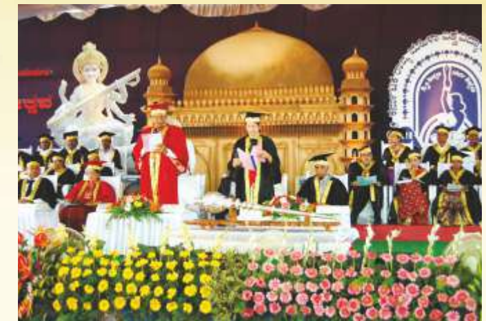
Chancellor and Governor of Karnataka Shri. Vajubai Vala declared 7th Convocation open